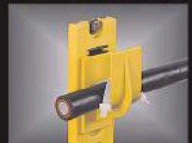
3HDS - 3" throat saddle shown with a cable secured by cable ties.