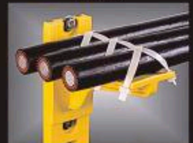
RA08 - 8" arm shown with three cables secured by cable ties.