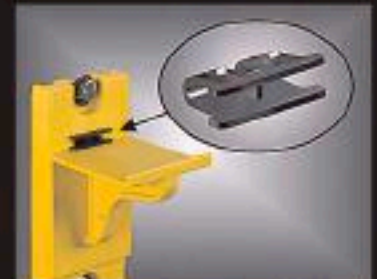
HDL - Arm lock shown with RA04 Arm and CR36-B Stanchion

*Concentrated load and deflection 1" from end of arm.